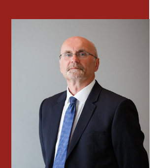
PRICE SENIOR EQUITY FUND MANAGER